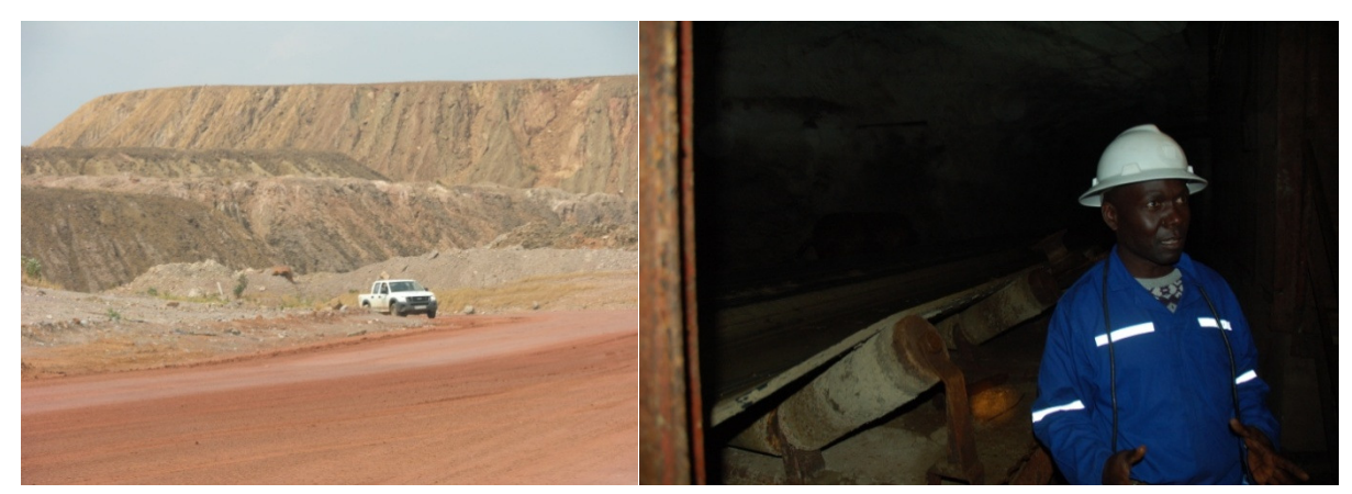
9 CONGOLESE WORKER

Overtime is frequent but little appreciated by the employees, since "it is subject to income tax and therefore poorly paid", according to the accounts received.