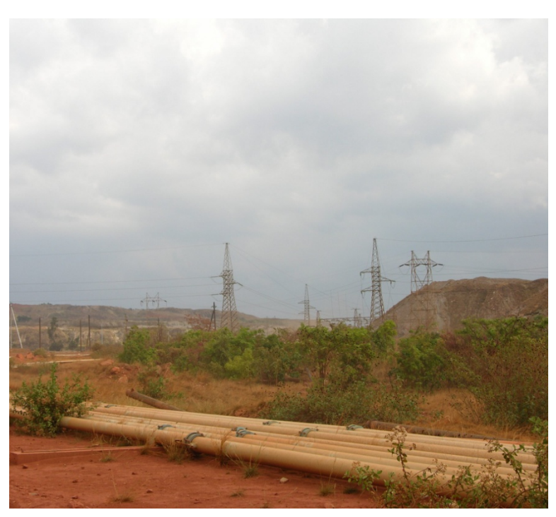
IN THE FOREGROUND, THE WHITE PIPES TRANSPORTING THE ORE FROM THE KAMOTO CONCENTRATOR TO THE LUILU HYDROMETALLURGICAL PLANT. IN THE BACK, THE DARKER PIPES CARRYING WATER TO LUILU AND WHICH HAVE BEEN PUNCTURED AND STOLEN.

In April 2011, two KCC employees went to Luilu to look at the drinking water network. They noted, in particular<sup>122</sup>: