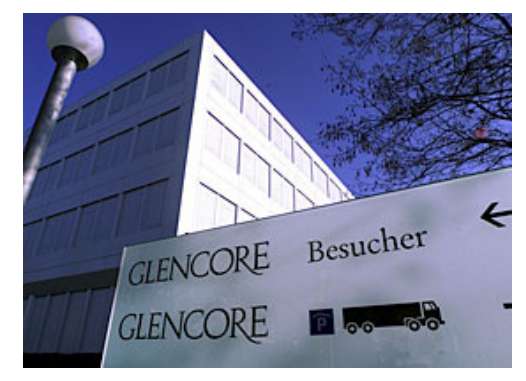
1GLENCORE HEADQUARTERS IN BAAR, IN THE CANTON OF ZUG

Glencore's stock market entry has had a positive effect on the transparency of the group, now required to publish very much more detailed information. Thus, in September 2011, Glencore published its first "Sustainability Report" and decided to support the Extractive Industries Transparency Initiative (EITI).