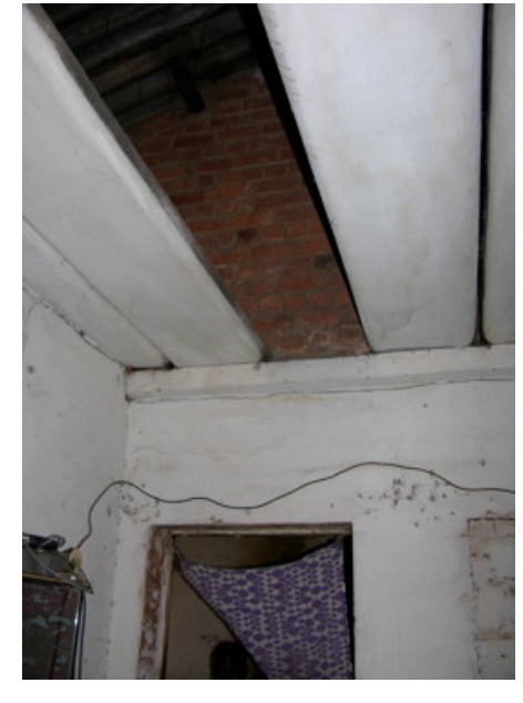
13 House, the exterior of which is cracked and the interior which has partially fallen down because of explosions in the T17 mine in Musonoi

Another problem concerns the façades of very many houses, which show large cracks. These cracks are, in the main, linked to the repeated explosions that took place in the T17 mine, located only a few tens of metres from the town, and which was operated until spring 2011. The ceiling of the living room has partially fallen down in one of the houses visited, which is located on the outskirts of the town, so rendering it uninhabitable. The situation of the cracked houses in Musonoi is well-known in the region. The inhabitants have been complaining for a long time about the adverse impact of the explosions on their homes. KCC acknowledges this damage but claims that some of the cracks are due to wear and tear and to lack of maintenance of the houses. The company also claims to have provided confidential