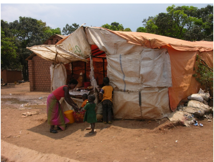
3 VILLAGE OF TILWEZEMBE

The Tilwezembe mine is some 30 kilometres from the town of Kolwezi and approximately three kilometres from national road no. 1 that goes to Lubumbashi. It includes 3 large open-pit mines of some 340 mine pits. To get to them, the visitor crosses the village. There are no clay or brick houses here; Tilwezembe is a temporary village, a village of miners who do not know when they will be chased away again. The houses are made of sheeting, most often of sheeting and sacks that used to be used to transport ore. Women run the various associated activities in the village: makeshift restaurants, a hotel made out of plastic sheeting, bars, a grocery shop, etc.