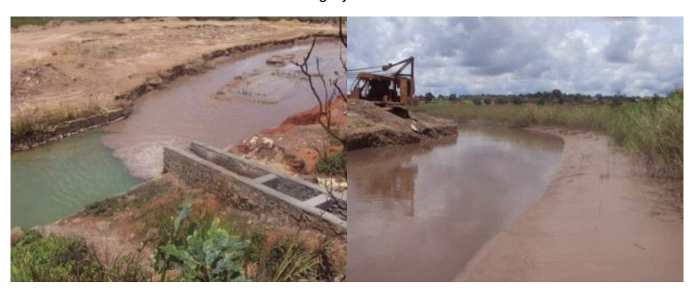
7 VIEW OF THE LUILU RIVER AFTER THE DISCHARGING OF THE WASTE WATER

It is important that Glencore's subsidiary resolve the problem of acid pollution as fast as possible and that it install a water treatment plant that meets international standards. This measure is, however, only one of the three aspects of its responsibility. The second consists of contributing to the decontamination of the river and banks. It is, moreover, what the firm Golder Associates implicitly implies when it states in the audit carried out for Glencore that: "The possibility exists that significant impact by mining-related spillages on the local stream/river systems may exist and needs to be confirmed by on-site assessment of potentially affected areas by a suitably qualified specialist. In the event that contamination that can safely be removed without causing excessive damage to the streambeds is identified, allowance has to be made for at least the de-silting and re-instatement of contaminated stream beds and banks. Other measures may also be required in order; to allow the natural aquatic ecosystems to return as far as possible. This could have a notable cost and has been excluded from this cost estimate, mainly due to uncertainty of responsibility for this environmental liability and the fact that such areas could not be detected from aerial imagery."73