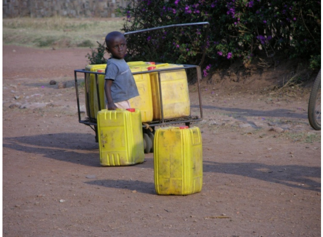
10 WATER SUPPLY IN MUSONOI

The situation twenty years ago, however, was different: the inhabitants of Musonoi, Luilu and elsewhere had running water. What happened?