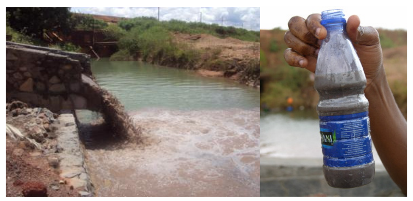
6 EFFLUENT FROM THE LUILU PLANT AND WATER SAMPLE TAKEN FROM THIS EFFLUENT.

We were not able to gain access to the Kamoto concentrator during the course of this research, but we were able to examine the impact of the Luilu hydrometallurgical plant on the environment. The results show massive pollution of the Luilu River, in particular by acid. This pollution can be seen with the naked eye: the water in the canal, which discharges the waste water into the river, is black and smells of rotten eggs. This is confirmed by touch: the water burns the skin and the irritation is persistent. But the pollution is, above all, verified by laboratory analysis.