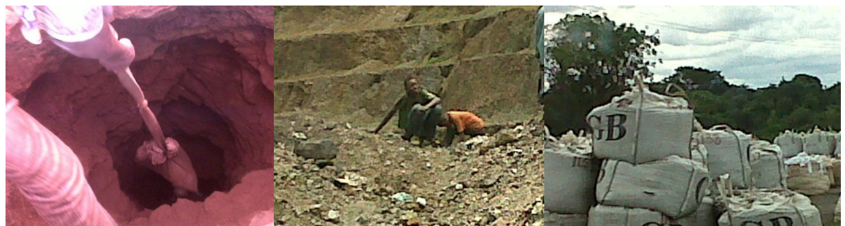
4 TILWEZEMBE MINE

Then, finally, in the mine, there are the private and public security forces. Security is ensured at Tilwezembe by three private security groups: Mobile, MAGMA and Star Security Services. There are 55 private guards on the site. Additionally,the official mine police is also present..