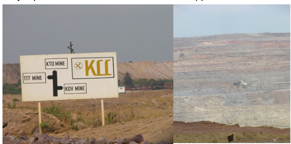
2 IN THE KCC MINES

KCC's exploitation rights actually cover six different deposits of copper and cobalt: the KOV and T-17 open-pit mines, the Kamoto underground mine and the unexploited mines of Mashamba Est, Tilwezembe and Kananga. These deposits are spread over an area of more than 40 km², i.e. an area about the size of the canton of Geneva. They represent some 16 million tonnes of copper reserves in total<sup>15</sup>.