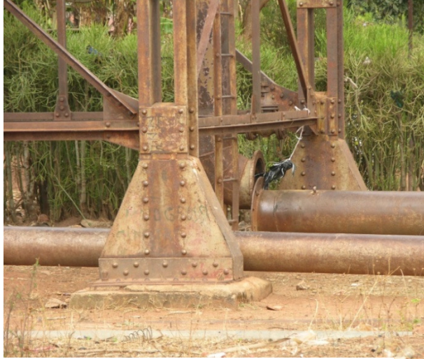
12 THE FORMER WATER TOWERS IN MUSONOI

towers located in the centre of the village and distributed through pipes to various parts of the village. The water towers were always full. And the water was fed to the taps in each neighbourhood.