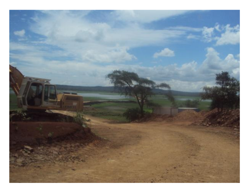
8 BARRIER CONSTRUCTED BY MUMI ON THE KANDO RIVER AT THE LEVEL OF RIANDA VILLAGE

Analysis of the samples taken near the barrier built by MUMI reveal that the firm is respecting the Congolese legal requirements.