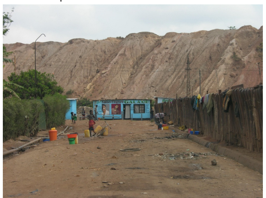
11 Entrance to the town of Musonoi, with the mounds from the mine in the background

Musonoi is a town located a few kilometres from Kolwezi. The dusty road that leads to the town crosses a lunar landscape, typical of mining regions: it snakes through mounds formed by mine waste and the deep open-pit mines. The exploitation of the mines, in particular of KOV and T17, is behind the construction of Musonoi at the time of Gécamines : a lot of workers were housed in these huts that are only a few tens of metres from the exploitations.